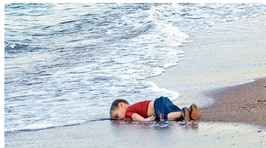
A child who died during moving to Greece

Syria is an Asian country located in the Eastern Mediterranean Ocean. The refugee issue in Syria is deeply related to the political problems in the Syrian government. Al-Assad’s family started their authoritarian regime in Syria in 1971. In 2010~2012, the spread of the so-called Arab Spring protests, which is a massive anti-government demonstration in the Arab world, overthrew numerous political systems including Syria. As conflicts between the protest groups and the government intensified, the protests resulted in civil war. During the civil war, many people, especially children, became refugees. Military groups such as Hezbollah, People's Protection Units, and Islamic Front were involved in the civil war and destroyed buildings, infrastructure, and roads. The conflicts of these various military groups threatened Syrian citizens. As a result, about one-third of Syrian people were chased from their home country. Eventually, nearly 4 million refugees occurred. These Syrian refugees accounted for 95% of the refugee camps in Syria’s neighboring countries.