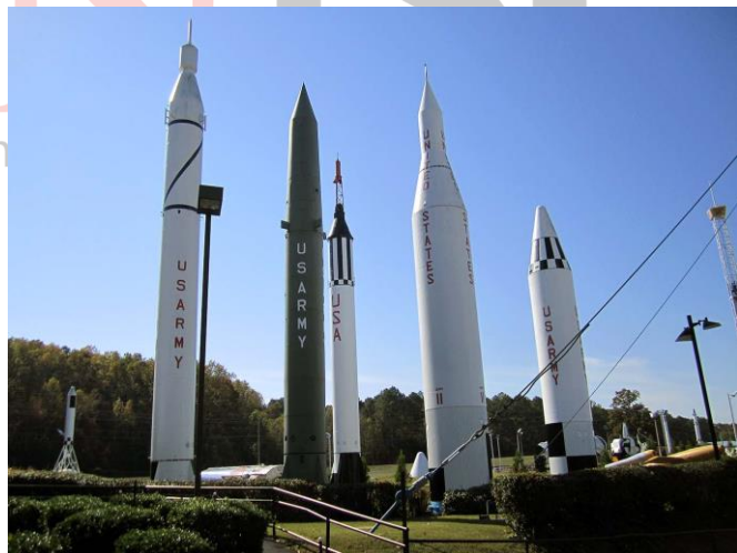
A Space and Rocket Center in the US

On January 14, 2017, former US President Donald Trump issued an executive order for federal agencies to investigate vulnerabilities in the country's manufacturing and supply sources related to the militarization of outer space. In a report to Congress, the Pentagon told US satellites and missiles have continued to depend on customized hardware and niche components that have been no longer manufactured domestically. Therefore, Defense Department's Fiscal Year 2020 Industrial Capabilities Report, which the DOD has had to submit annually to the congressional defense committees, said such old programs should invest in new technologies and qualify new suppliers.