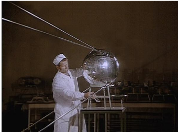
The first satellite that launched from the Soviet Union, Sputnik I

Since the Soviet Union has launched its first satellite, Sputnik I, in 1957, space militarization has been a contrast concern in the United Nations (UN). In recent years, leaders of various countries, including former US President Donald Trump, have been interested in space militarization.