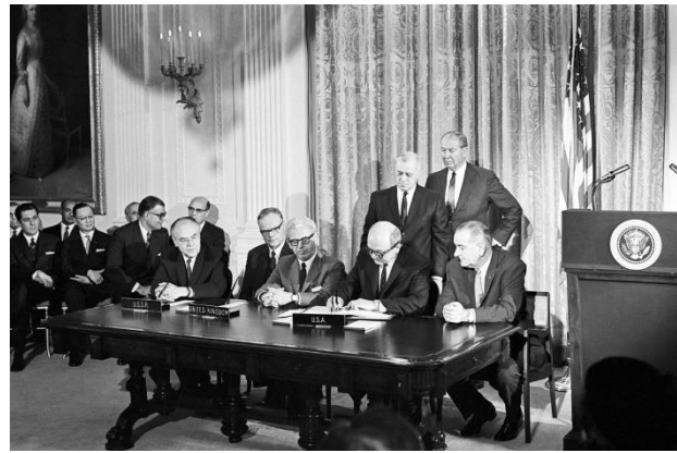
Delegates from other countries are signing the Outer Space Treaty

There is another treaty related to the demilitarization of outer space, which is the Prevention of an Arms Race in Outer Space (PAROS). It is a peace treaty that has received almost unanimous support from the international community, including Russia and China, while the US refused to negotiate on the grounds of missile defense and the superiority of potential space weapons. The Bulletin of the Atomic Scientists reported that the US rejected all four resolutions of the 2018 UN General Assembly's First Committee meeting dealing with disarmament and the prevention of space weaponization.