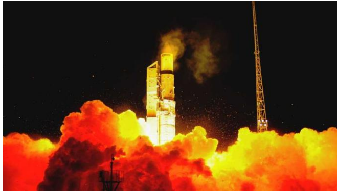
A missile launched into space in Russia

dominance in space, continuing to increase its military space assets. Russia strives to expand its anti-access/area-denial approach in space into electronic warfare, increase the sustainability of its communication systems, and develop attack capabilities on ground-based space infrastructure.