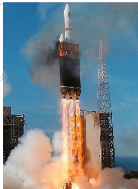
A spy satellite in the US

military equipment is not progressing fluently. To be specific, in external space, “spy satellites” are registered in the UN register of space objects, but they have been marked exactly. They contain phrases such as “earth observation” or “research” just under the direction of “general function of objects”. Nevertheless, the reason why they have known as military satellites is that the Department of Defense (DOD) sometimes spears as an “appropriate designator”. The International Atomic Energy Agency (IAEA) Statute also uses the terms “peaceful purpose” and “military purpose” but does not define them clearly. In order to solve the problems listed above, the Agency must support the peaceful use of nuclear energy and be no longer used for “military purposes”.